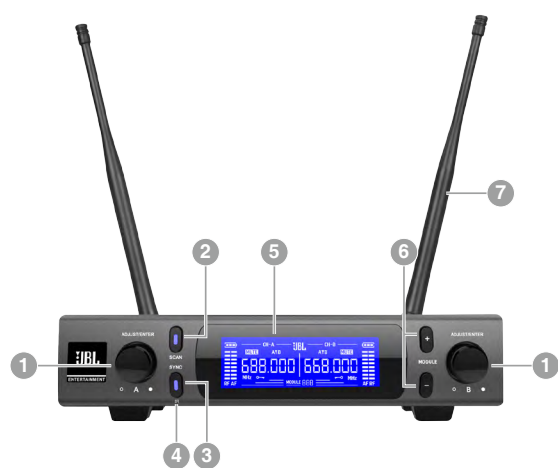
SR300 - Front