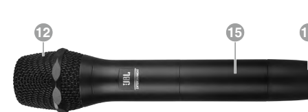
HT300 - Rear