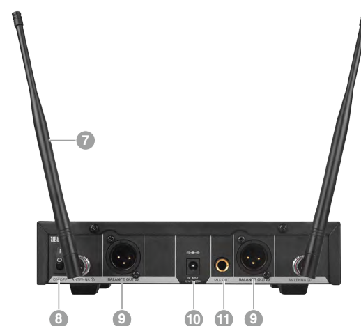
SR300 - Rear