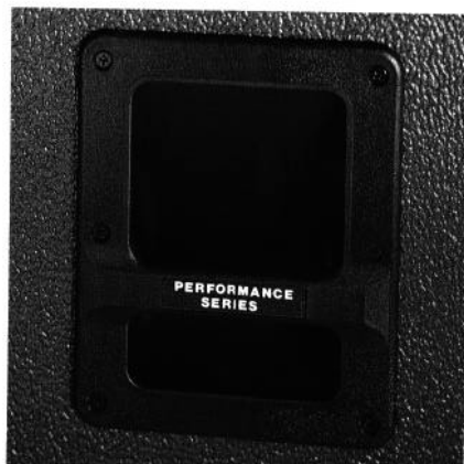
All Performance Series systems have easy-to-grasp, recessed handles.

G-731 Full-Range Stage Monitor System —A lightweight 12-inch two-way floor monitor system designed to deliver high acoustic output from the smallest, most portable package. Engineered to tilt at two different angles, allowing the performer to optimize the monitor's projection angle.