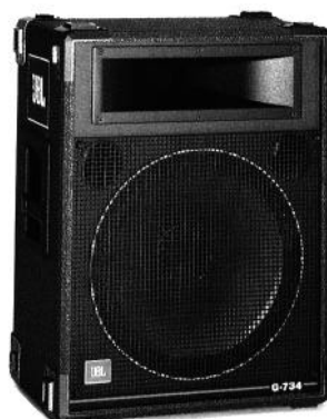
G-734 DIRECT-RADIATOR SOUND SYSTEM

G-791 High-Frequency Power Pack —Contains horn, driver, and crossover network for musicians who want to custom load components in their own enclosures. Can be added easily to existing equipment to augment high-frequency performance.