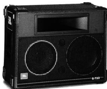
G-733 THREE-WAY KEYBOARD/ REINFORCEMENT SYSTEM

G-732 Full-Range Horn-Loaded Reinforcement System —An extremely high efficiency sound reinforcement system which utilizes the new G135A-8 low frequency driver mounted in a horn enclosure. Exhibits extremely wide bandwidth and smooth response. The G-732 can generate very high sound pressure levels, thus making the most of available amplifier power. Can be used for general-purpose sound reinforcement or for amplifying today's electronic musical instruments.