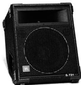
G-731 STAGE MONITOR SYSTEM