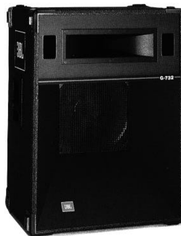
G-732 HORN-LOADED REINFORCEMENT SYSTEM