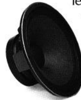
The G125-8 300mm (12 inch) loudspeaker.