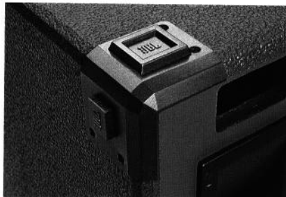
The Performance Series' new corner protectors bear the distinctive JBL logo.

G-730 Full-Range Vocal Reinforcement System —A compact 12-inch two-way sound system designed to yield high acoustic output from the smallest, most portable package. Exhibits extremely wide bandwidth, smooth response and outstanding efficiency.