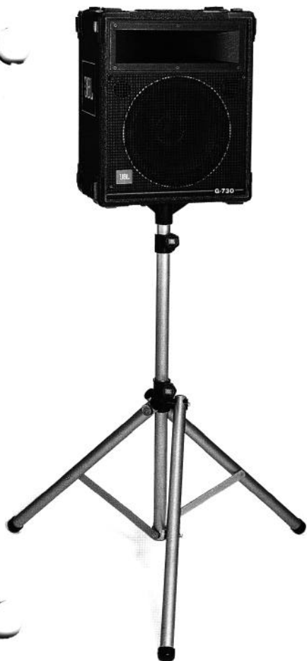
G-730 VOCAL REINFORCEMENT SYSTEM