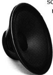
The G135A-8 380 mm (15 inch) loudspeaker.

To remedy this situation, JBL launched its G Series in 1986. Both the G125-8 and G135A-8 offer full-bodied sound without top-end noise. And both have