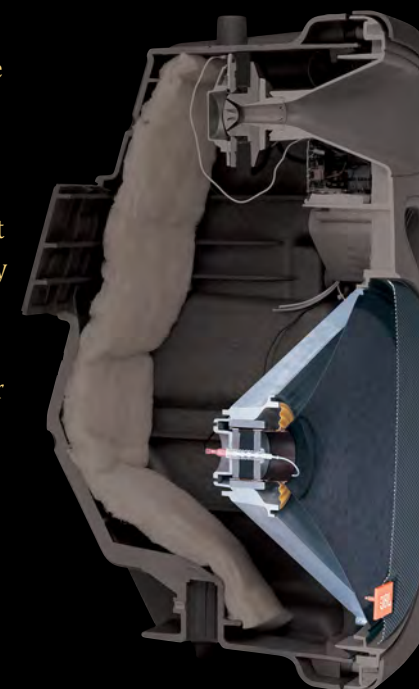
The EON15 G2 replaces 20 lbs. (91 kg) of conventional magnet with a few ounces of neodymium.

You also won't see the neodymium Differential Drive® woofer design. But you'll know it's there every time you pick up an EON15 G2. We've replaced 20 lbs. (91 kg) of conventional magnet with a few ounces of neodymium and reduced both harmonic and flux modulation distortion in the bargain.