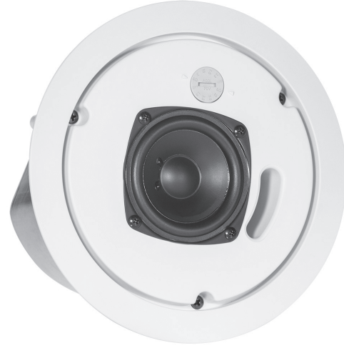
Included grille not shown.

Ideal for a wide variety of projects, the Control 12C-VA is switchable for use as either an 8 ohm low-impedance speaker or as part of a 70V or 100V distributed loudspeaker system with a 15 Watt multi-tap transformer. Each speaker comes complete with gland nut, two tile rail supports, one C-ring support backing plate, cutout template, paint shield and grille. A safety seismic attachment ring is provided on the terminal cover.