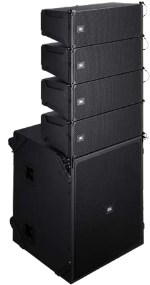
Fig. 4: Ground Stack Option

When setting inter-box angles of 8° and above, the angle bar of the upper box may obstruct the angle bar from the box below from aligning with the desired value. In such cases, the angle bar of the upper box must be stored using the Quick Release Pin in the 'Standby' hole.