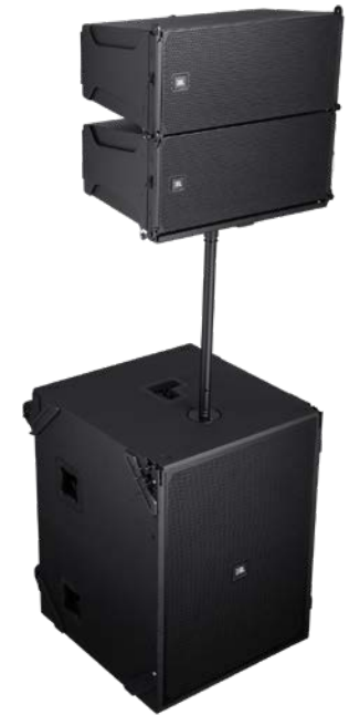
Fig. 6: Pole Mount Option

The system sub/top balance in this pole mount configuration will have more sub energy (when compared to the ground stack option using 1 sub + 4 tops). We recommend reducing the sub volume from the mixer if required.