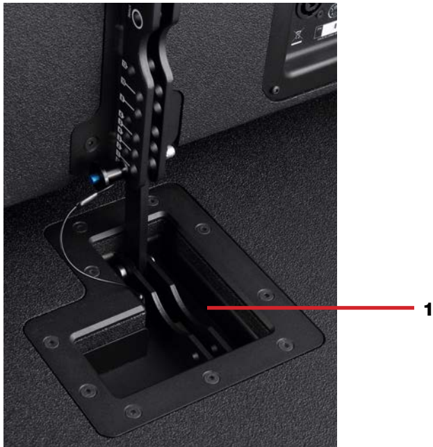
Fig. 5: BRX325SP Top View