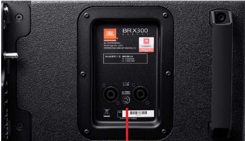
Fig. 2: Speaker Connectors