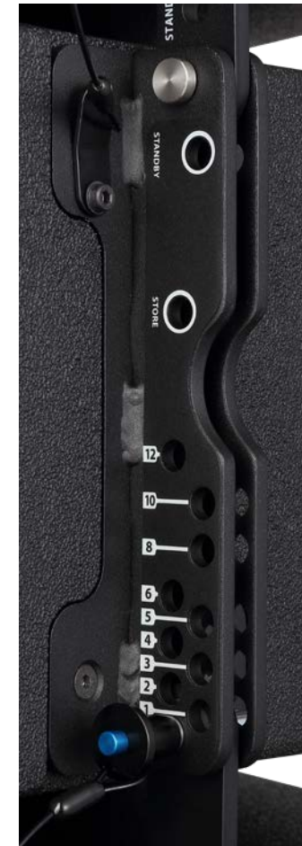
Fig. 3: BRX308-LA Angle Bar View

There are two 4-pole speaker connectors on each BRX308-LA loudspeaker. See Figure 2. These are connected in parallel and either connector may be used as INPUT or THRU to daisy-chain to another loudspeaker. Up to two BRX308-LA speakers may be connected in parallel to one amplifier output.