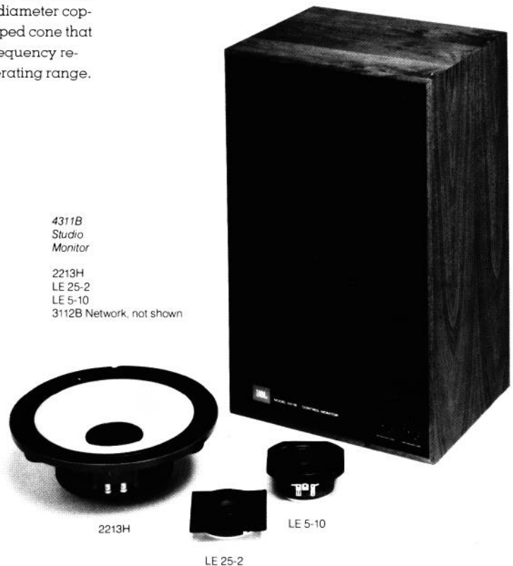
4311B Studio Monitor 2213H LE 25-2 LE 5-10 3112B Network, not shown

As with all JBL loudspeaker systems, the component transducers, frequency dividing network and enclosure are designed and tested to function as a single, integrated unit. The enclosure is solidly constructed of 19 mm (¾ in) stock throughout with wood-welded joints to prevent unwanted resonance. Internal padding absorbs spurious reflections and standing waves. All components mount directly to the baffle panel and are removable from the front of the enclosure. A ducted port provides proper acoustical loading of the low frequency loudspeaker.